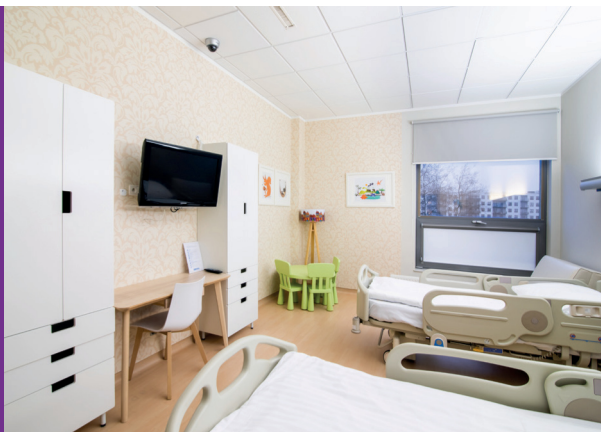
Medicover Hospital - Patient's room and bathroom