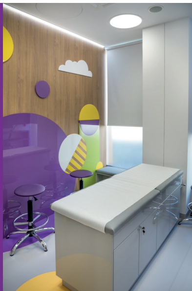
Paley European Institute - Doctor's office