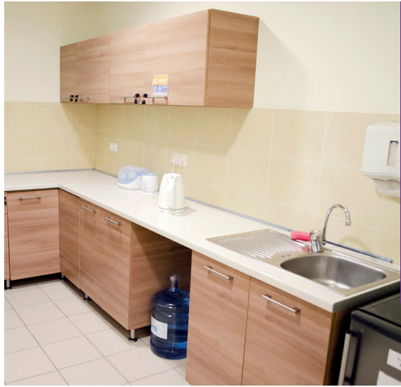
Medicover Hospital - Kitchen room

In addition, the hospital provides nappies, primers and wet wipes, as well as bed linen.