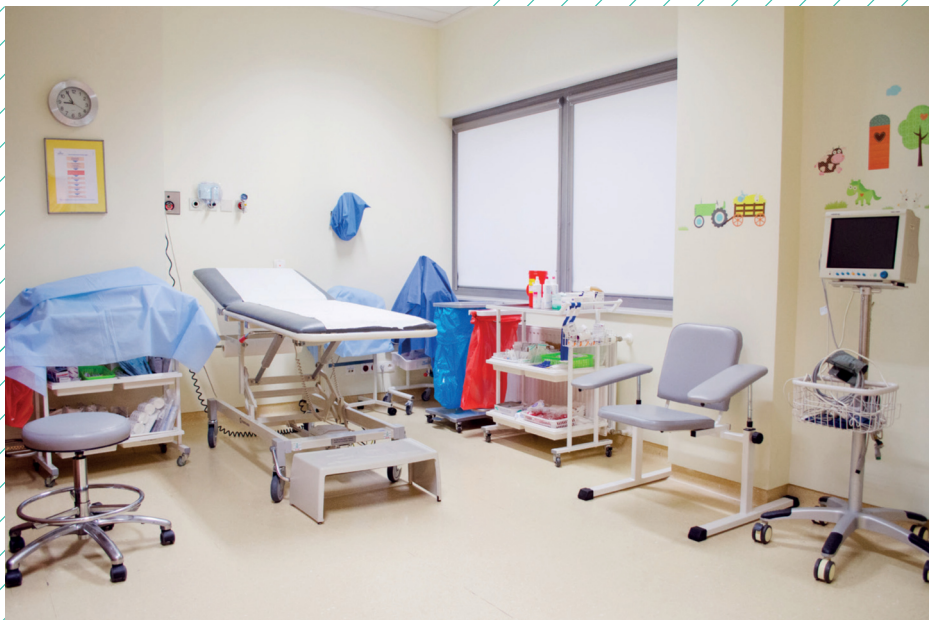
Medicover Hospital - Treatment room