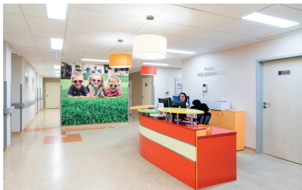
Medicover Hospital - Nurse's duty point

Parents are not allowed to sleep in the intensive medical surveillance room! The room is used for consumption of prepared meals and other daily activities and is assigned on the day of admission to the ward.