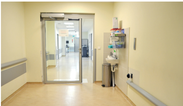
Medicover Hospital - Spot

On the spot, the parent decides whether he or she wants to continue accompanying the child. If he or she decides to enter the operating theatre, he or she will be asked to dress up in specially prepared protective clothing.