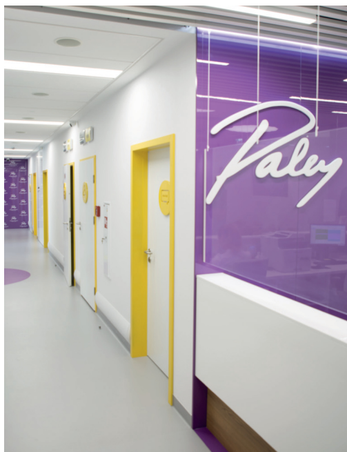
Paley European Institute

Depending on the possibilities, an appointment with the anaesthesiologist will take place at the PEI medical clinic or at the Medicovert Hospital.